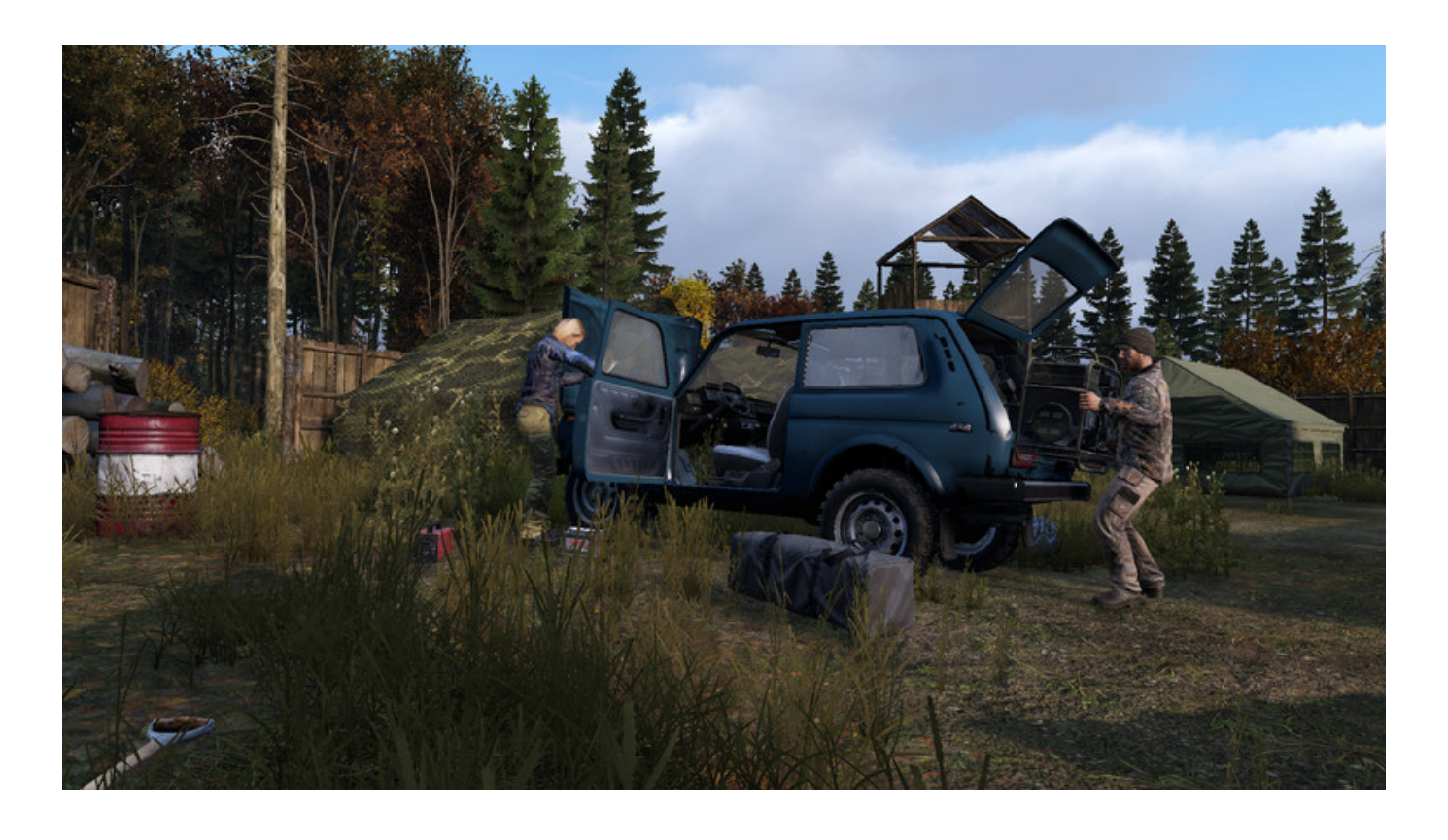
STOORM - Full Edition. Download For Pc Compressed

Download >>> <a href="http://bit.ly/2JmP2Ti">http://bit.ly/2JmP2Ti</a>